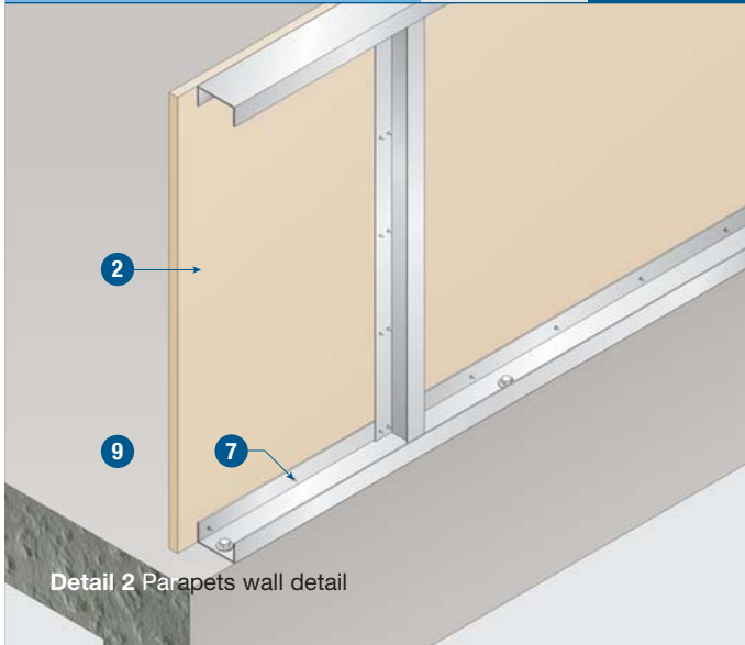
Detail 2 Parapets wall detail